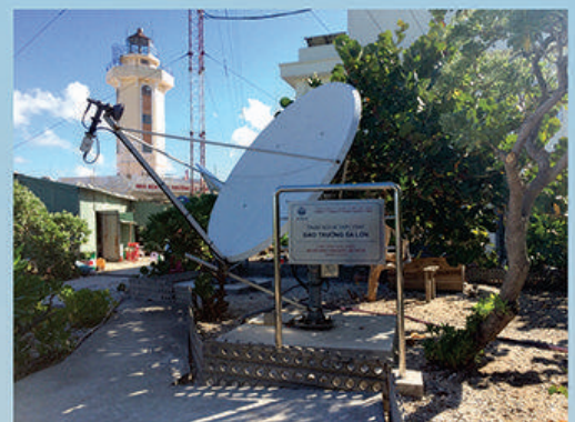
VHF/SAT ATTECH stations at Truong Sa Lon and Song Tu Tay islands.