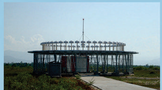
DVOR/ DME station