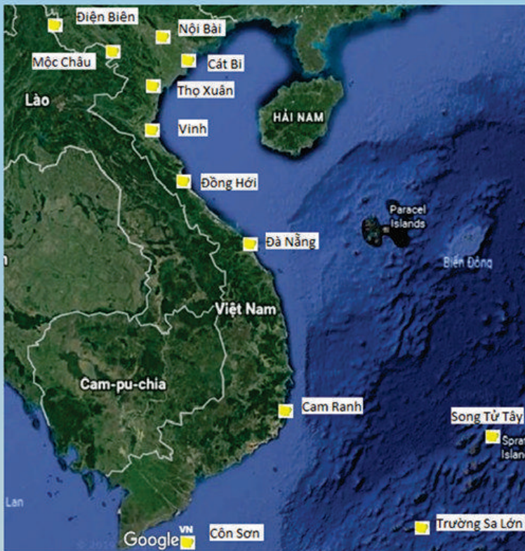
ADS-B stations system installed and operated by ATTECH